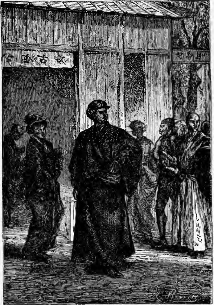
Passepartout went out muffled up in an old Japanese robe.